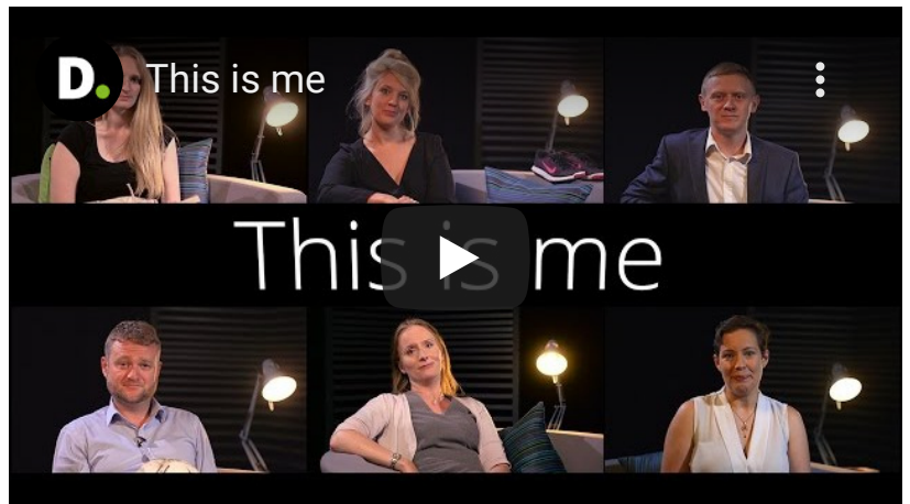
Video created by Deloitte